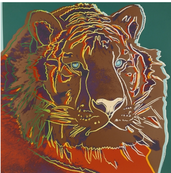
Andy Warhol, Siberian Tiger (from the Endangered Species series) , 1983