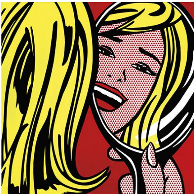
EVENING SALE - 12 NOVEMBER 2014 POST-WAR AND CONTEMPORARY ART

An Exhibition featuring highlights of Post-War and Contemporary Art 10-18 September 2014