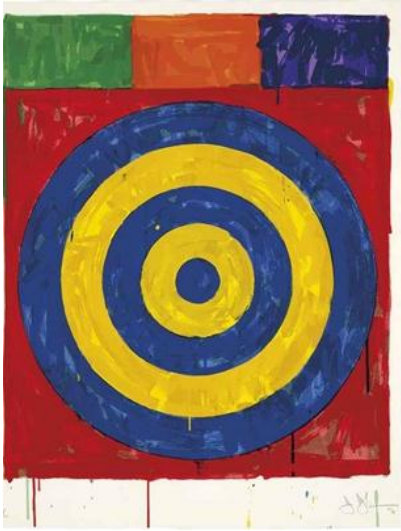
CHRISTIE'S PRIVATE SALE JASPER JOHNS (b.1930) Target Screenprint in colors, 1974 34 x 26 in.