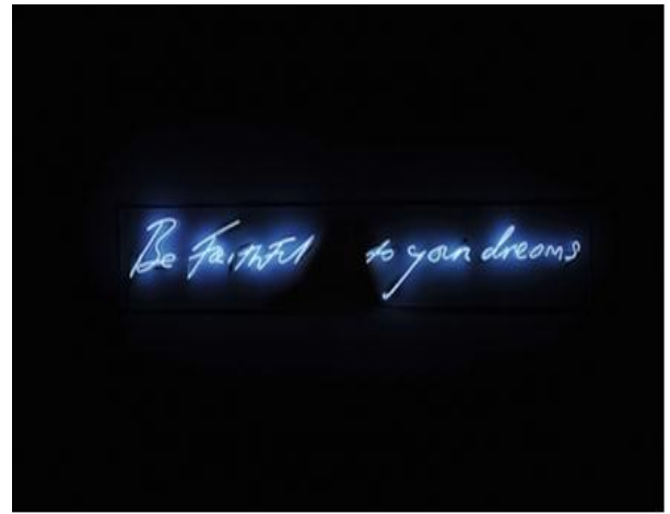
CHRISTIE'S PRIVATE SALE TRACEY EMIN (b.1963) Be Faithful to your dreams Blue neon on Plexiglas 15 7/8 x 87 7/8 x 2 7/8 in. Executed in 1998. edition of three.