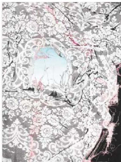
FIRST OPEN – 23 SEPTEMBER 2014 MARK FLOOD (b. 1957) A Summer's Day acrylic on canvas laid on panel 48 x 36 in. Painted in 2007. Estimate: $35,000-45,000