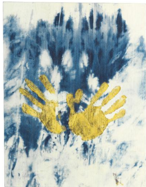
FIRST OPEN – 23 SEPTEMBER 2014 POST-WAR AND CONTEMPORARY ART

ROY LICHTENSTEIN (1923-1997) Girl in Mirror Porcelain enamel on steel 42 x 42 x 2 in. Executed in 1964. This work is from an edition of eight. Estimate: $2,000,000-3,000,000