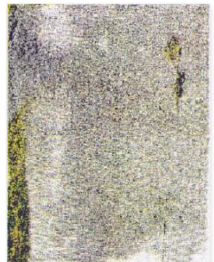
FIRST OPEN – 23 SEPTEMBER 2014 ISRAEL LUND (b. 1980) Untitled acrylic on canvas 11 x 85/8 in. Painted in 2012. $20,000-30,000

PRESS CONTACT: Capucine Milliot | +1 212 641 5078 | cmilliot@christies.com